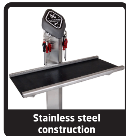
Stainless steel construction

Visit www.bikefixtation.com or call 612-568-3494 (USA) for more information