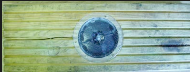
Figure 1 - Damage of SolarEye 80 product in decking following a compressive load of 600kN

Testing was undertaken on a Dennison 600kN tensile machine in order to determine the compressive strength. The SolarEye 80 product was loaded at increments of 20kN, between 20kN and 600kN, prior to being unloaded, checked and reloaded, in order to determine the point at which the light no longer functioned.